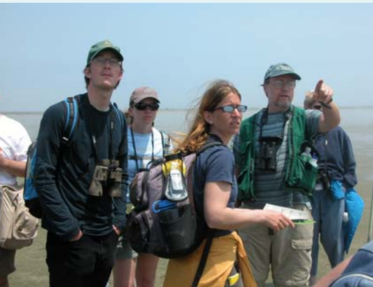
Summer practicum stressing field work to acquire technical skills

The Coastal Institute at the University of Rhode Island, an international leader in coastal and marine science and policy, is offering five traineeships. This NSF-funded “Integrative Graduate Education and Research Traineeship” (IGERT) Project is supporting a new generation of Ph.D.-level graduate students to study coastal science and policy.