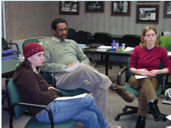
Intensive course in logic, communication and leadership