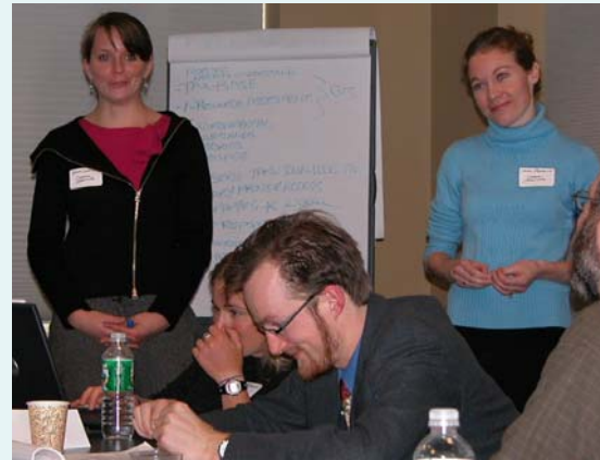
Small tutorials on communicating with the public and media relations