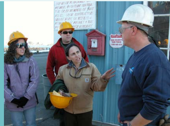
Training in ethics, social equity and intercultural issues

A nine-month funded placement with a partner organization – federal, non-profit or national institute